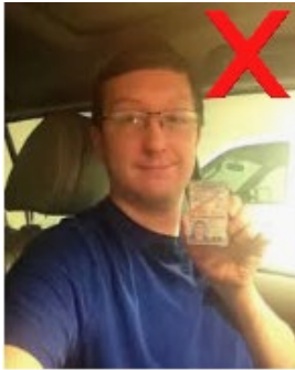
Figure 3- BAD SELFIE (Light glare)